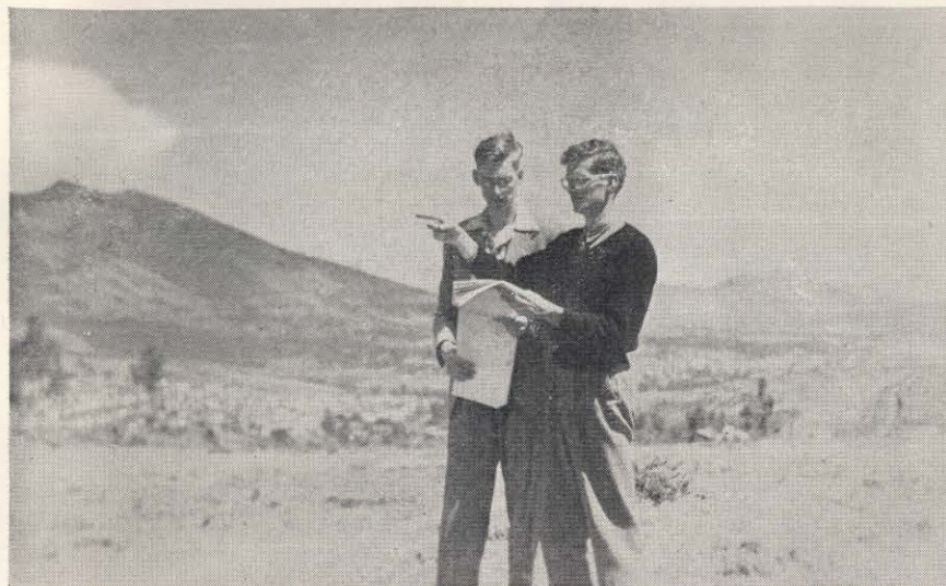
Looking Over the New Site for the Transmitters of HCJB

Under the blessing of God, expansion is steadily going on at HCJB. Increasing personnel, more programs, two additional languages (Lithuanian and Bohemian) for broadcasting the Gospel, more and more listeners—all these are part of the regular, healthy growth of the Pioneer Missionary Broadcaster.